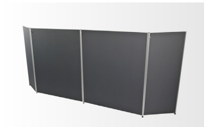
*FOH Table Cover