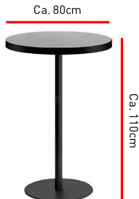
Table must be delivered to the location/stage until (and not later)